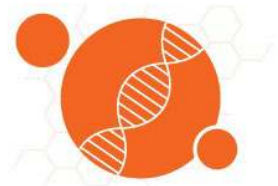
SOLUBLE COLLAGEN Collagen