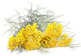
ITALIAN IMMORTELE FLOWER HYDROLATE Helichrysum italicum