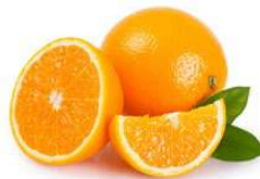
SWEET ORANGE HYDROLATE Citrus aurantium dulcis