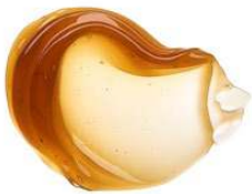
HEMP EXTRACT Cannabis sativa L.

Ingredients: AQUA, HELICHRYSUM ITALICUM FLOWER WATER, GLYCERIN, CAPRYLIC/CAPRIC TRIGLYCERIDE, PRUNUS AMYGDALUS DULCIS OIL, COCO-CAPRYLATE, CANNABIS SATIVA LEAF EXTRACT, SUCROSE LAURATE, CITRUS AURANTIUM DULCIS FRUIT WATER, TOCOPHEROL, ALLANTOIN, PANTHENOL, SOLUBLE COLLAGEN, SODIUM HYALURONATE, SODIUM ASCORBYL PHOSPHATE, GLUCONOLACTONE, SODIUM BENZOATE, DEHYDROACETIC ACID, BENZYL ALCOHOL, VANILLA PLANIFOLIA FRUIT EXTRACT, SIMMONDSIA CHINENSIS SEED OIL, XANTHAN GUM, RETINYL PALMITATE, LINALOOL, D-LIMONENE