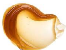
HEMP EXTRACT Cannabis sativa L.

Ingredients: AQUA, PERSEA GRATISSIMA OIL, STEARIC ACID, COCO-CAPRYLATE/CAPRATE, CAPRYLIC/CAPRIC TRIGLYCERIDE, CANNABIS SATIVA BIOMASS EXTRACT, DIMETHYL SULFONE, CETEARYL ALCOHOL, GLYCERYL STEARATE, AESCULUS HIPPOCASTANUM SEED EXTRACT, RUSCUS ACULEATUS ROOT EXTRACT, SORBITAN CAPRYLATE, PROPANEDIOL, BENZOIC ACID, SODIUM CETEARYL SULFATE, ROSMARINUS OFFICINALIS EXTRACT, BRASSICA CAMPESTRIS SEED OIL