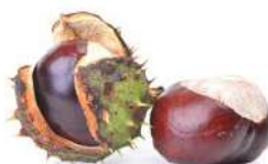
HORSE CHESTNUT EXTRACT Aesculus hippocastanum L.