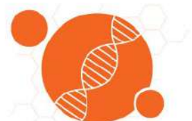
SOLUBLE COLLAGEN Collagen