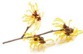
WITCH-HAZEL LEAF HYDROLATE Hamamelis Virginiana Leaf Water