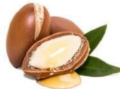
ARGAN OIL Argania spinosa L.