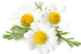
ROMAN CHAMOMILE HYDROLATE Anthemis nobilis