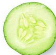
CUCUMBER HYDROLATE Cucumis sativus L.