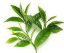
GREEN TEA LEAF EXTRACT Camellia sinensis