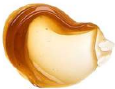
HEMP EXTRACT Cannabis sativa L.

Ingredients: AQUA, ANTHEMIS NOBILIS FLOWER WATER, CUCUMIS SATIVUS FRUIT WATER, GLYCERIN, CAPRYLIC/CAPRIC TRIGLYCERIDE, PRUNUS AMYGDALUS DULCIS OIL, COCO-CAPRYLATE, CANNABIS SATIVA BIOMASS EXTRACT, SUCROSE LAURATE, CITRUS AURANTIUM DULCIS FRUIT WATER, ALLANTOIN, CAMELLIA SINENSIS LEAF EXTRACT, PROPYLENE GLYCOL, SODIUM HYALURONATE, GLUCONOLACTONE, SODIUM BENZOATE, DEHYDROACETIC ACID, BENZYL ALCOHOL, XANTHAN GUM