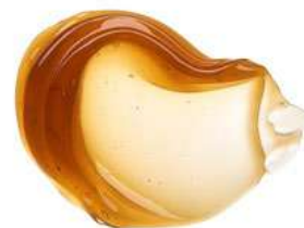
HEMP EXTRACT Cannabis sativa L.