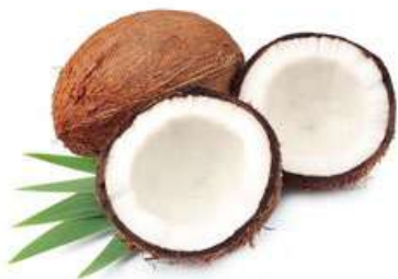
MCT OIL Caprylic/capric triglyceride

Ingredients: CAPRYLIC/CAPRIC TRIGLYCERIDE, CANNABIS SATIVA BIOMASS EXTRACT